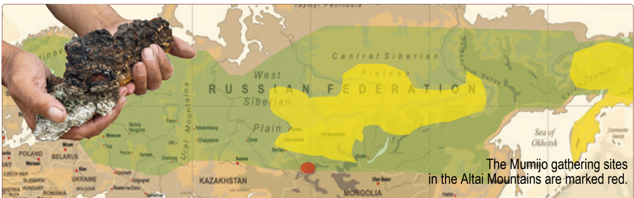
The Mumijo gathering sites in the Altai Mountains are marked red.